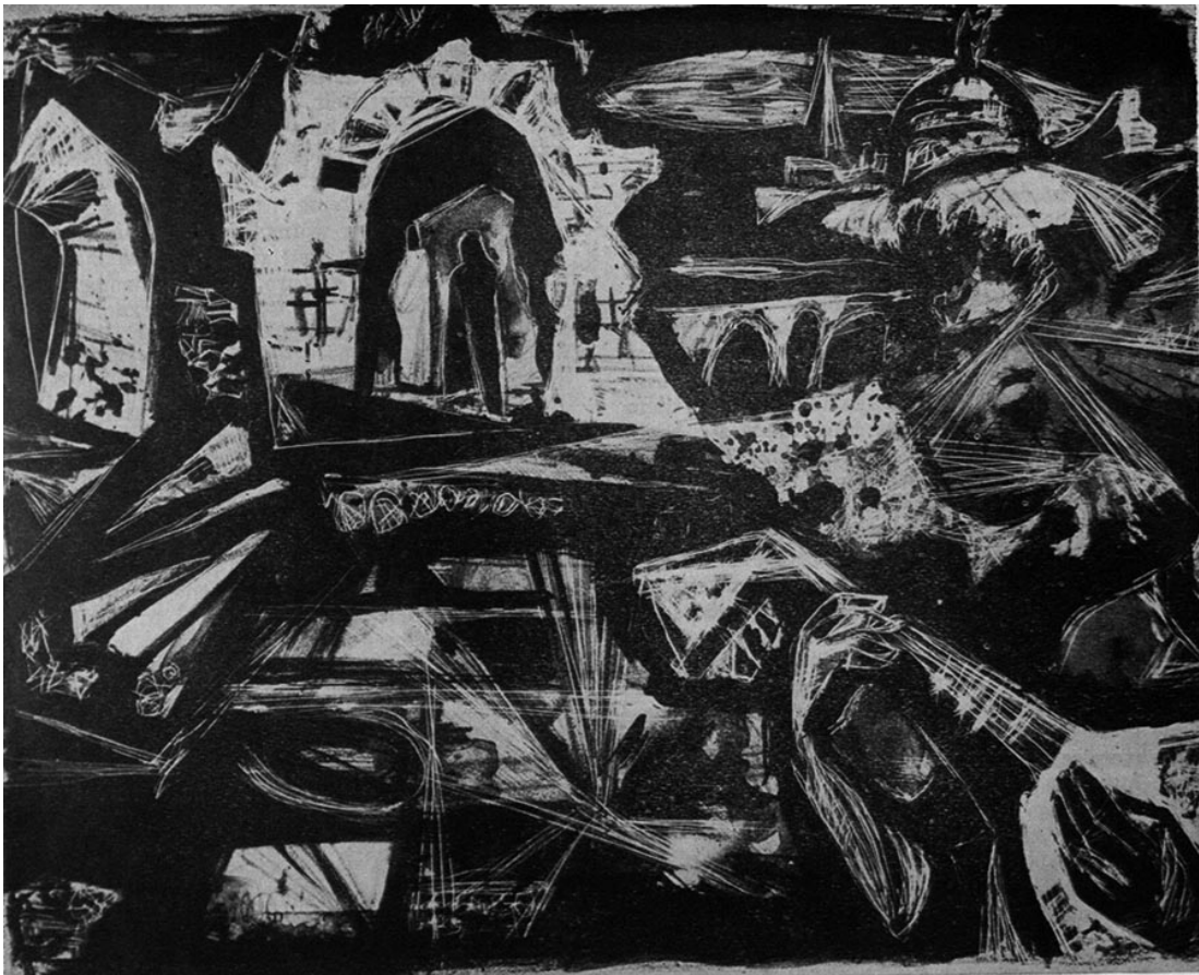
Memories of Rome