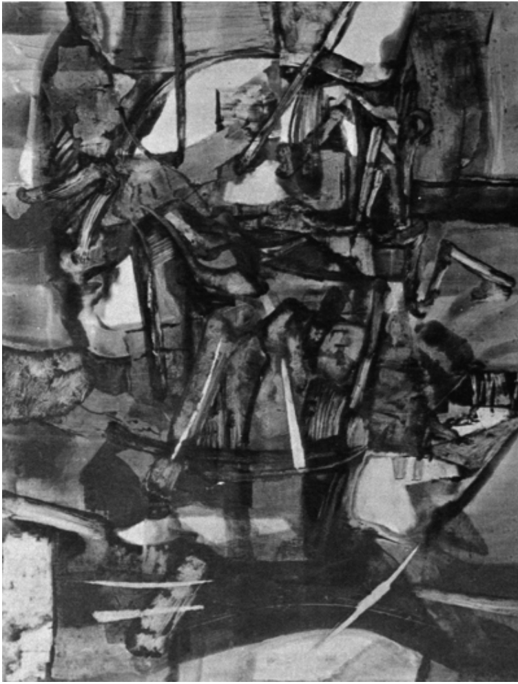
Telesforas Valius, THE LAST MORNING VI 1961, Colored Drawing, 22" x 28"