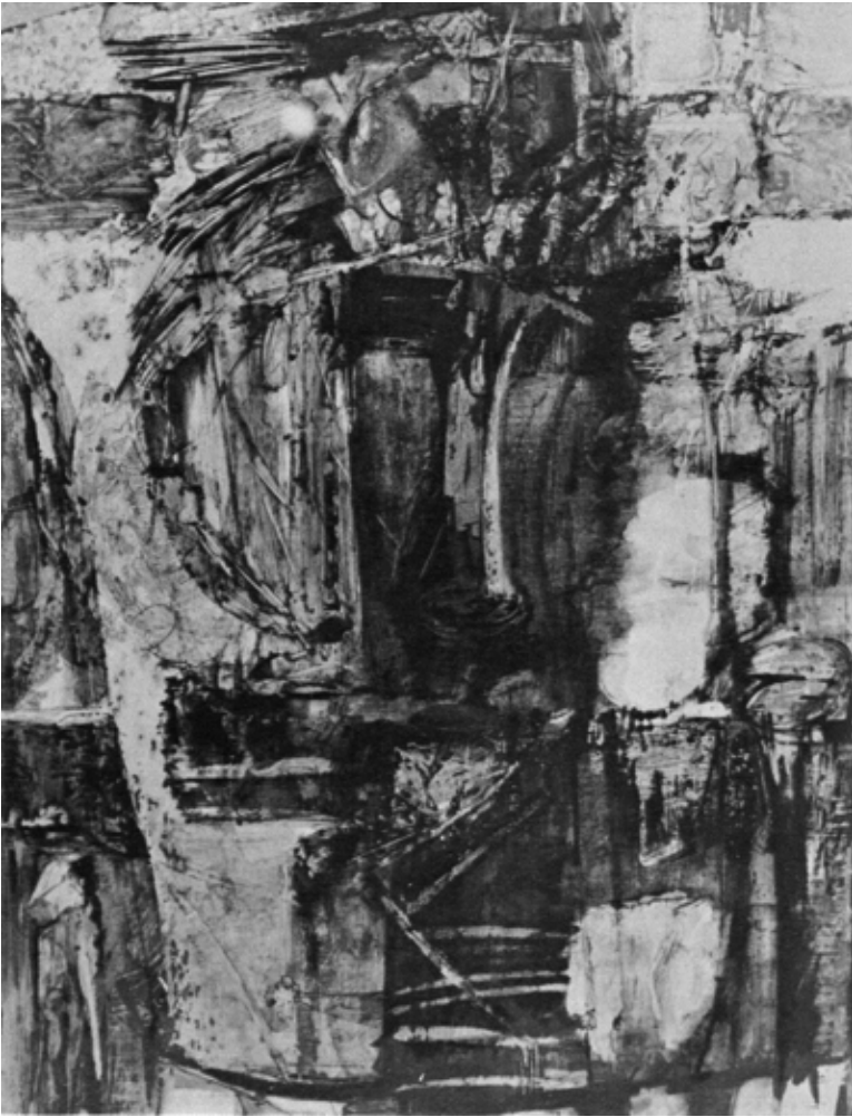
Golgotha VI 1965 Colored Drawing, 22" x 28"