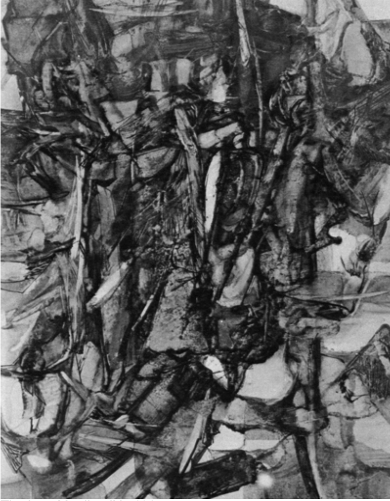
The Last Mortaring IX 1965 Colored Drawing, 22" x 28"