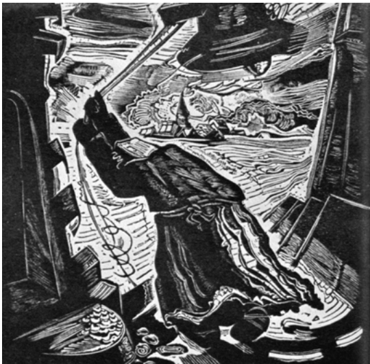
Five O'clock In A Lithuanian Village 1945 Woodcut, 7" x 7"