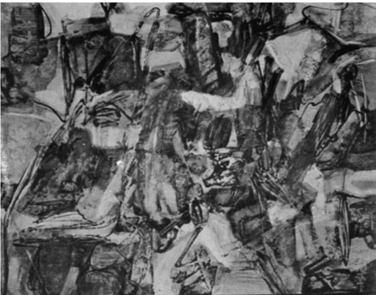
The Last Morting VIII 1964 Colored Drawing, 22" x 28"