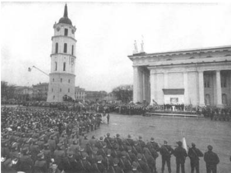
Inauguration Ceremony of Valdas Adamkus - President of the Republic of Lithuania in the Vilnius Cathedral Plaza, February 26, 1998