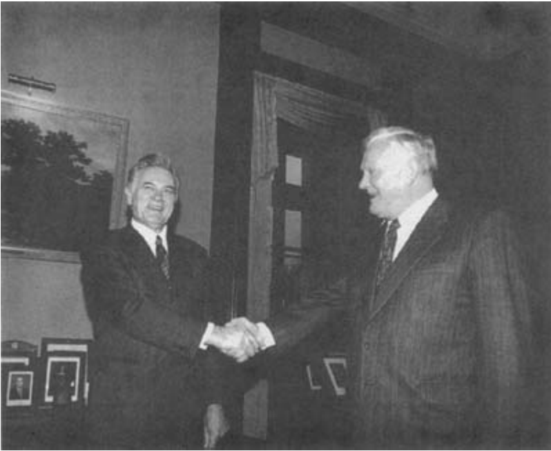
First official meeting in the Presidential Office with the Outgoing President Algirdas Brazauskas