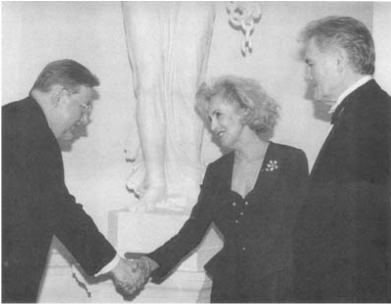
Vytautas Landsbergis, Chairman of the Parliament, greets Mrs. Alma Adamkus and President Valdas Adamkus, February 26, 1998.