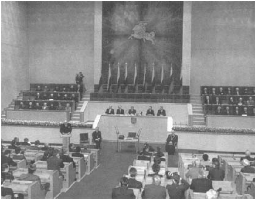
A view of the Parliament in Session