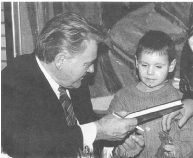
The first autographed book to the youngest fan