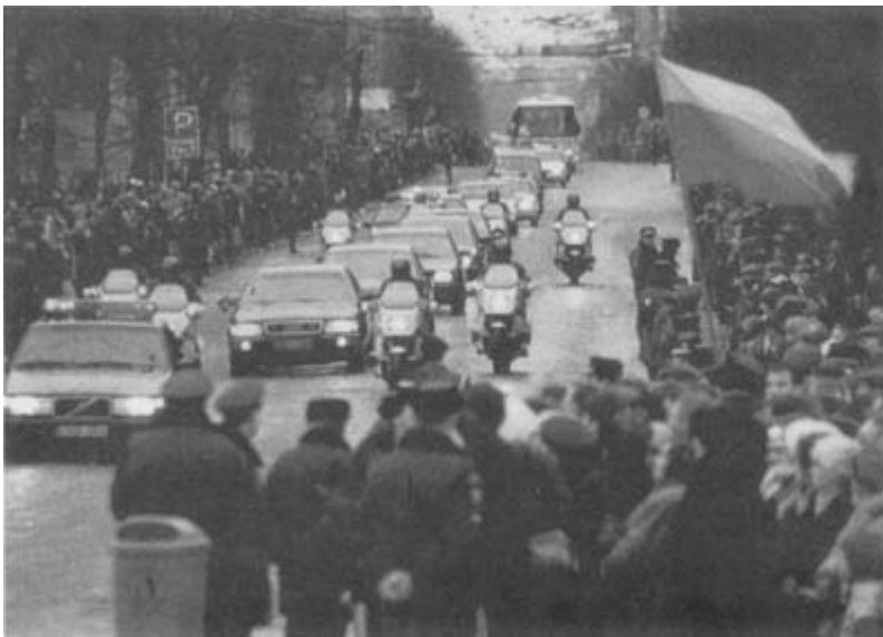
President Elect Valdas Adamkus is escorted to the Inauguration Ceremony