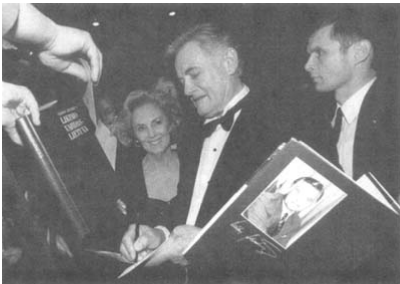
The Candidate Valdas Adamkus signs copies of his autobiography (Name of the Destiny - Lithuania)