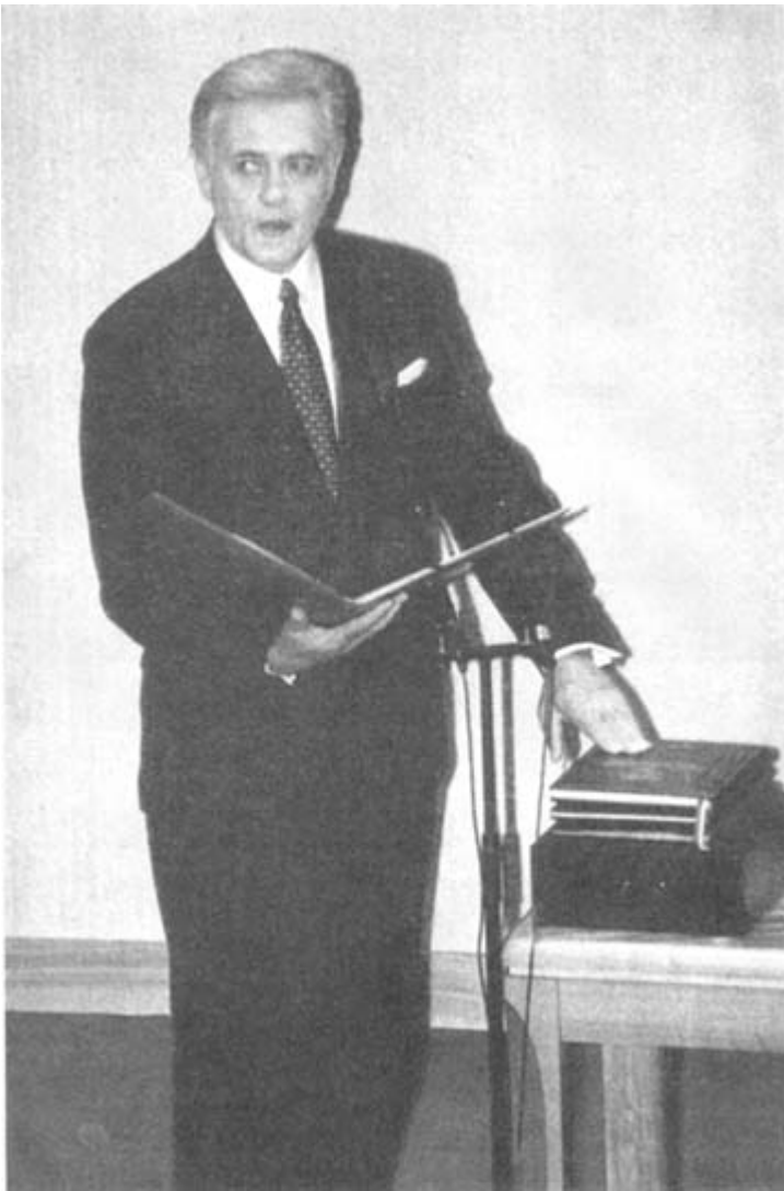
Swearing in of the President Valdas Adamkus