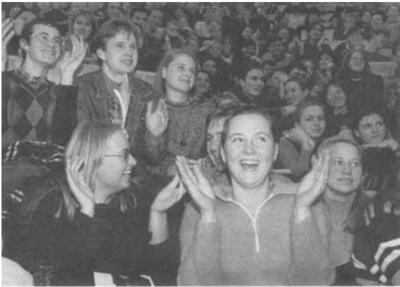
Meeting the Vilnius University students