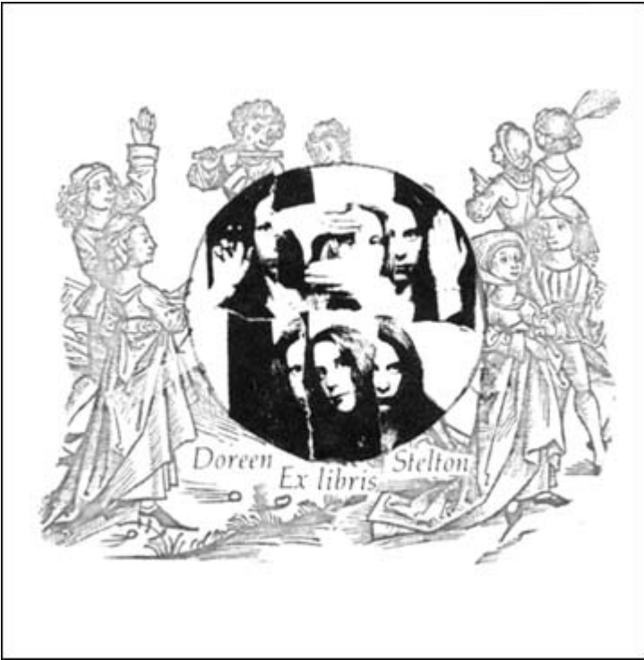
Doreen Stelton, 1982, actual size