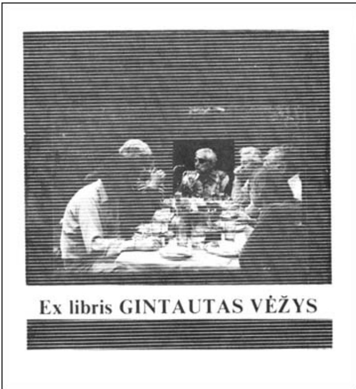
Gintautas Vėžys, 1982, actual size