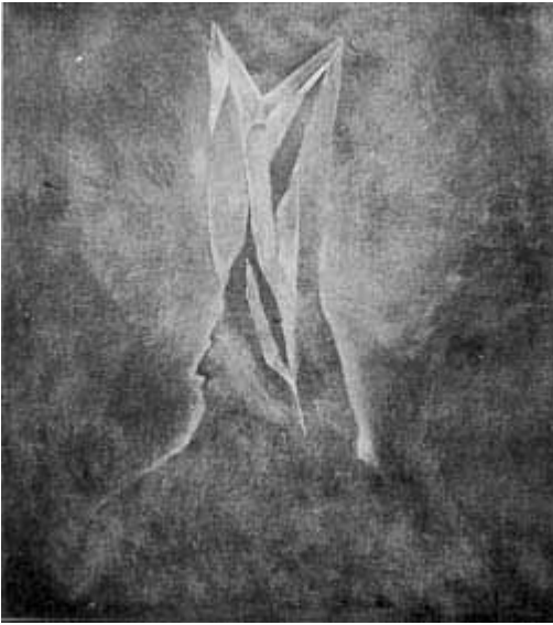
King with a Golden Crown, 1987, oil on canvas, 38"x34", collection of the artist.