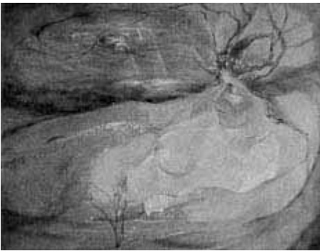
Eglé, 1981, oil on canvas, 24"x36", private collection.