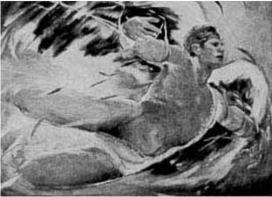
Icarus, 1975, oil on board, 40"x50", collection — American Academy of Arts and Science, Boston, Mass.