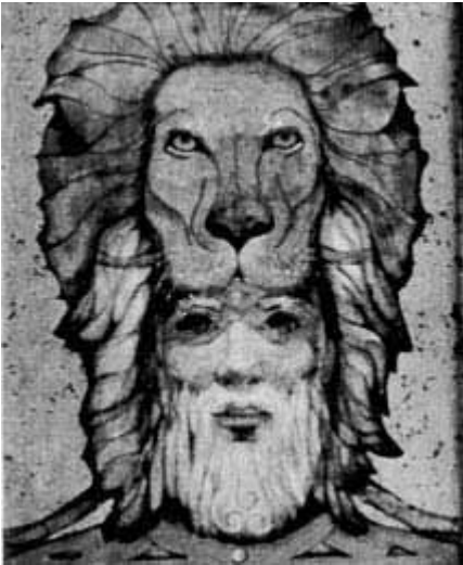
Man with a Lion Mask, 1994, egg tempera on board, 14"x41"