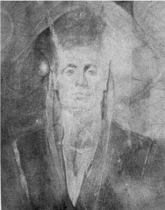
Petronous, mixed media on paper, 30"x24", private collection.