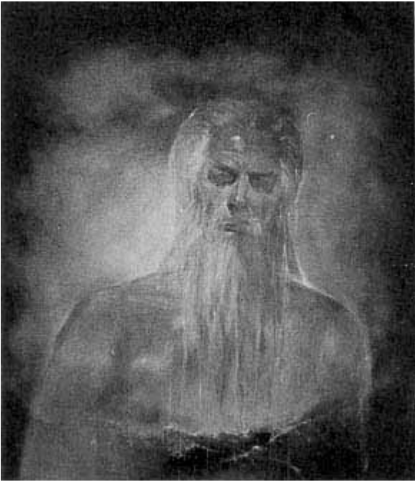
Neptune, oil on canvas, 36"x30", private collection.