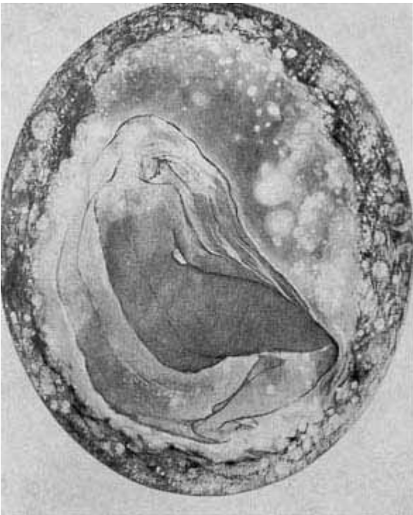
Aurora, 1979, watercolor, 30"x24", private collection.