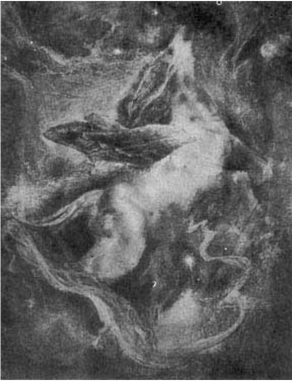
Pegasus, watercolor, 39"x24", collection — Children's Hospital, Philadelphia, PA.