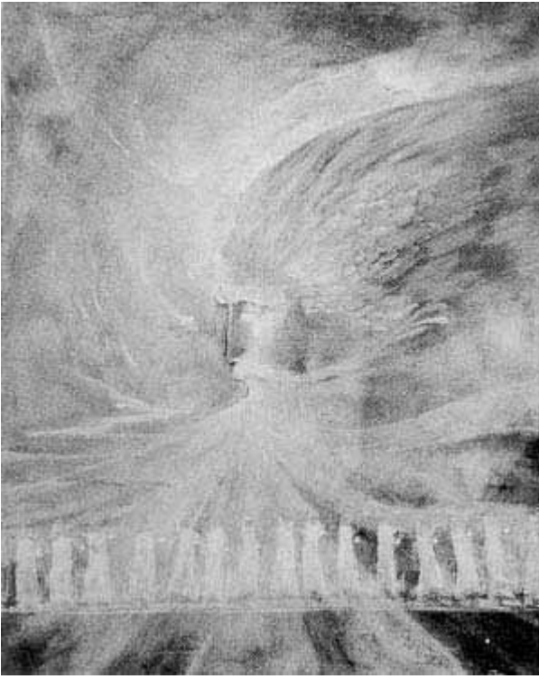
Vaidilutės, 1994, oil on canvas, 28"x34", collection of the artist.