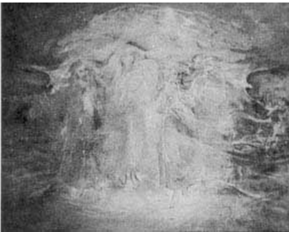
Song of the Animals, 1994, oil on gesso board, 16"x20".