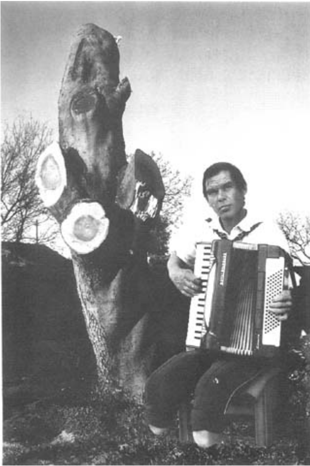
Serenade to lost limbs