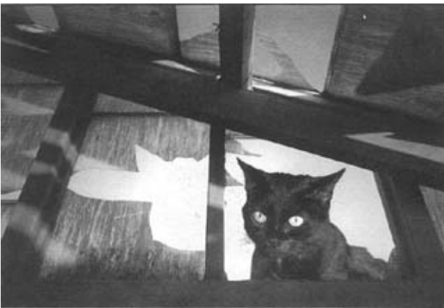
The cat in the window