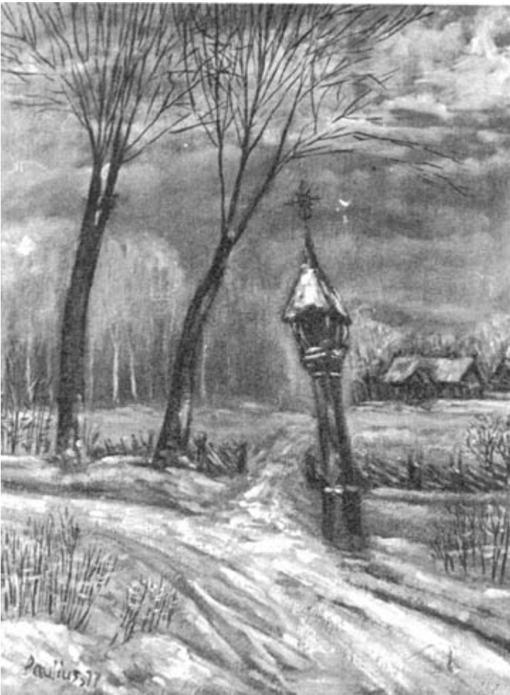
Winter in a Lithuanian Village. Oil, 1977.