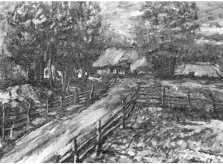
In Samogitia 1. Oil, 1977.