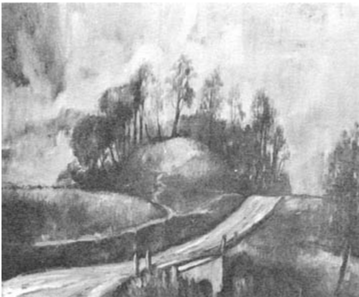
The Džiugas Hill. Oil, 1972.