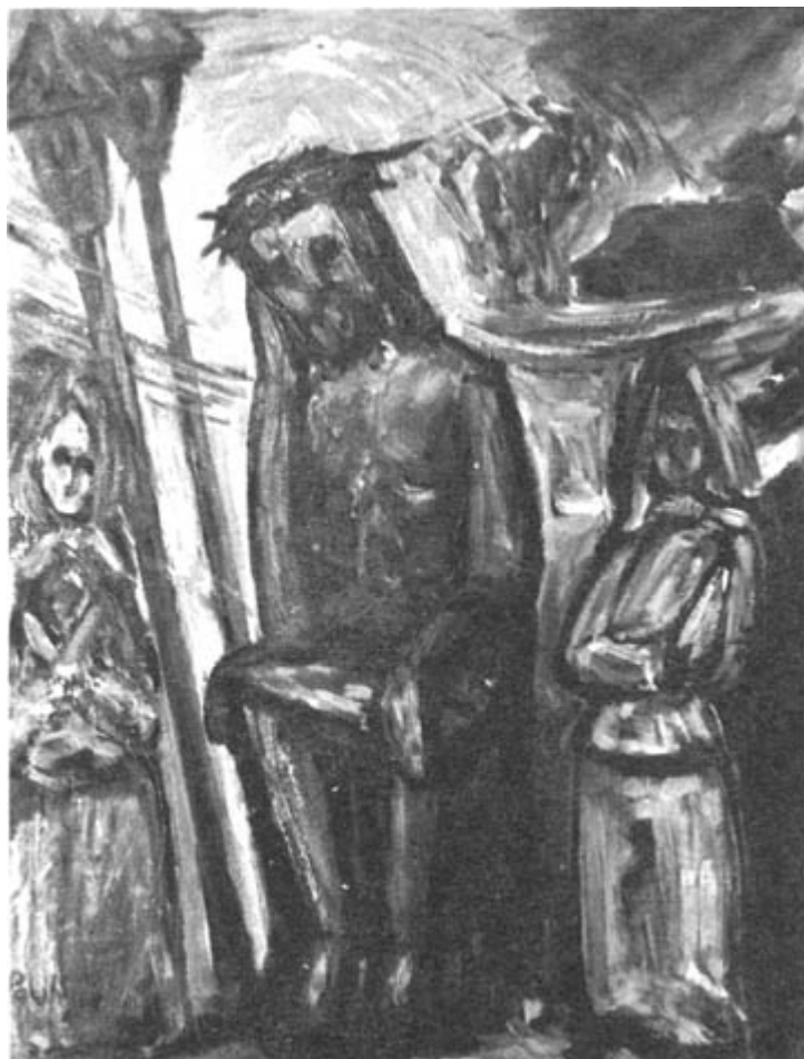
Rūpintojēlis (The Sorrowful Christ) in Samogitia. Oil on paper, 1963.