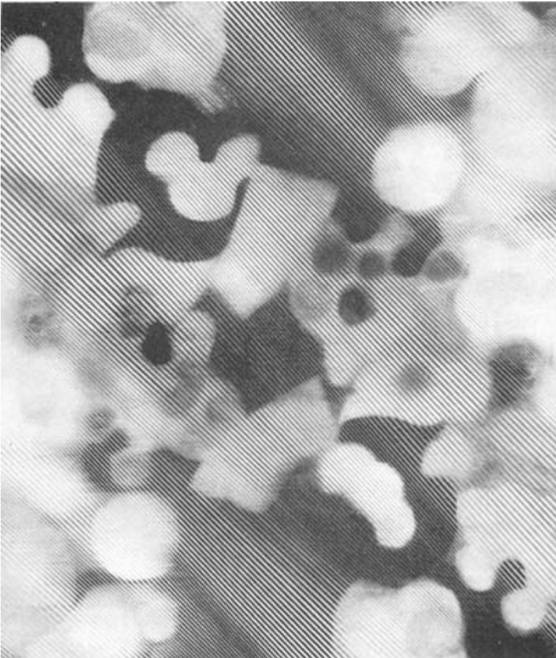
Kazimieras Žoromskis, Encounter in Space, 1975