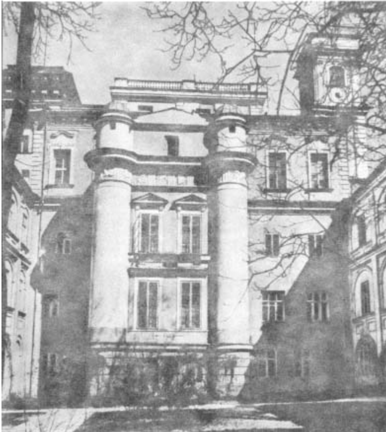
The Old Observatory towers, dating to the second half of the 18th century