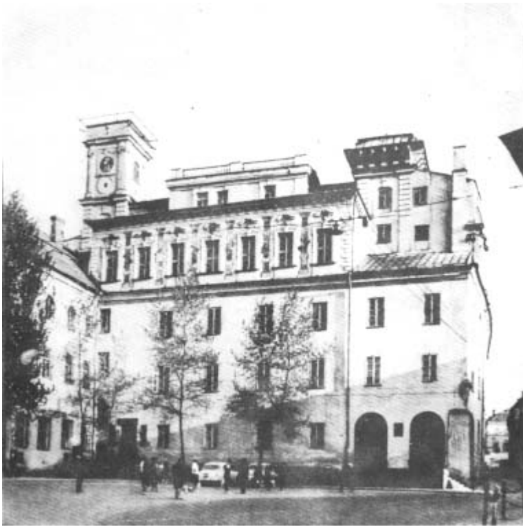
The Central Building and Library