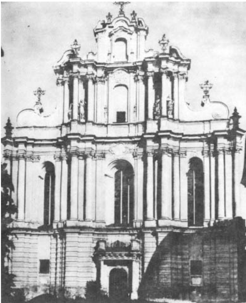
The Church of St. John — the oldest structure on the campus, dating to the fifteenth century — originally was built in Gothic style, but acquired an ornate baroque facade after reconstruction sometime in the 1740s. The Soviet regime has converted the church into "a museum of progressive thought."