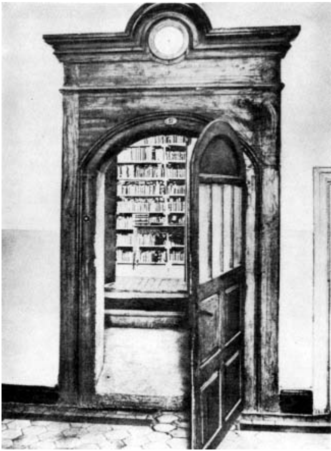
Doorway to the graphic arts room in the Scientific Library