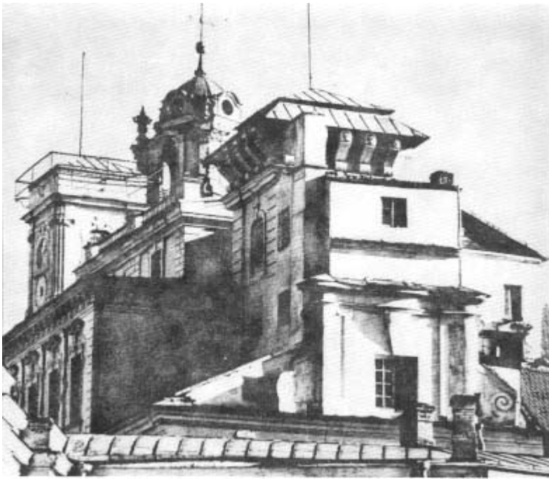
Towers of the university, reflecting a variety of styles